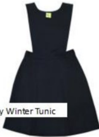
Navy Winter Tunic