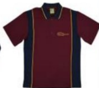
Short/Long Sleeve Polo Shirt