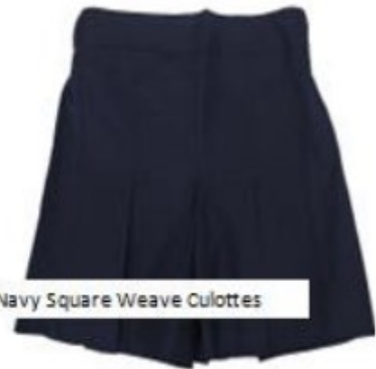
Navy Square Weave Culottes