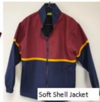
Soft Shell Jacket