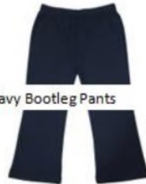
Navy Bootleg Pants