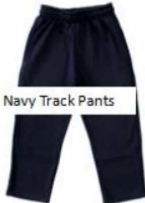
Navy Track Pants